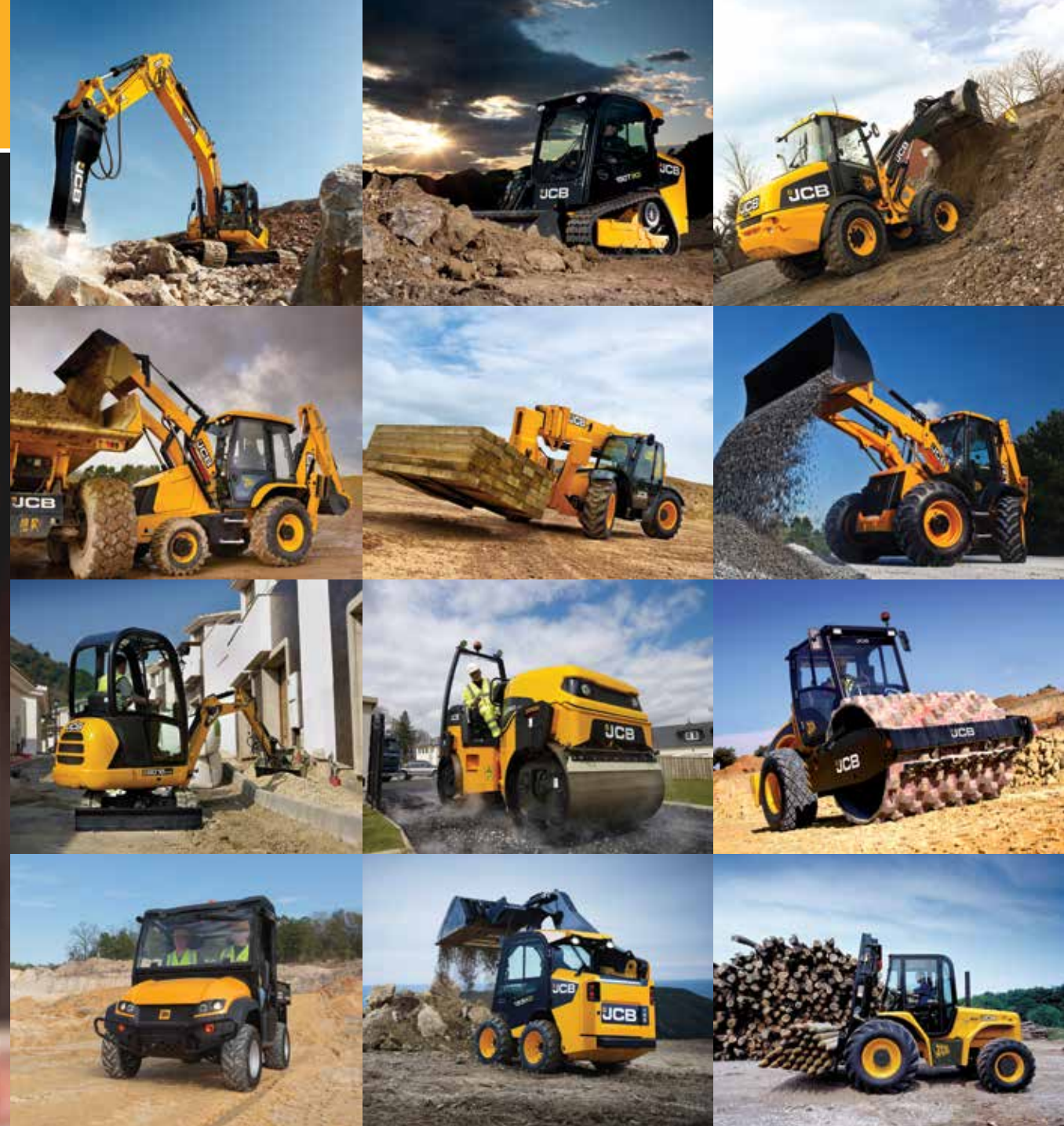
ONE COMPANY, OVER 300 MACHINES.